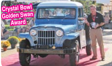
Crystal Bowl Golden Swan Award