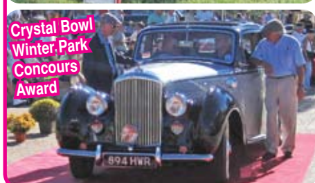
Crystal Bowl Winter Park Concours Award