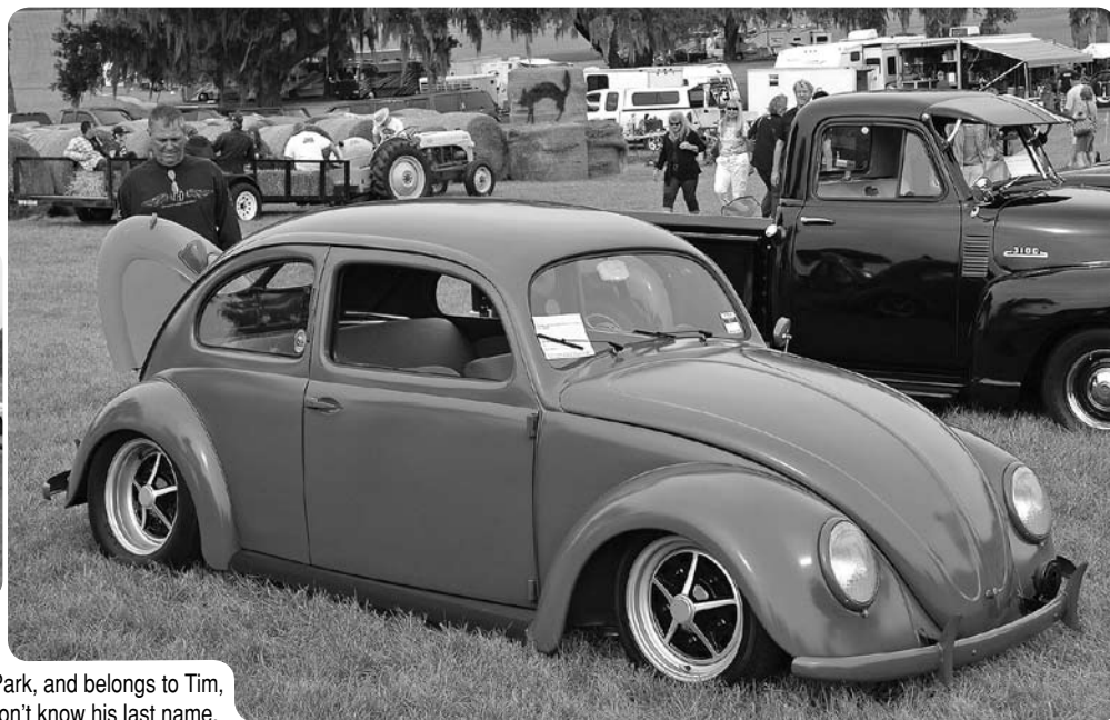
RIGHT: This 1947 VW Beetle was really neat, thanks to a really low stance, flat gray paint, and an immaculate engine, complete with a dual carb setup. It is based out of Winter Park, and belongs to Tim, but since he didn't fill out his window card completely we don't know his last name.

The car show included giveaways to the first 500 pre-registered cars, and lots of judged classes with awards and prizes. Show car registration was $30, and when you take into account it included two passes for the weekend, it was a very good value.