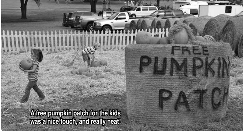
A free pumpkin patch for the kids was a nice touch, and really neat!