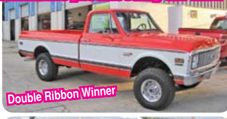
Double Ribbon Winner